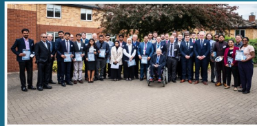
The MERIT 2019 Finalists