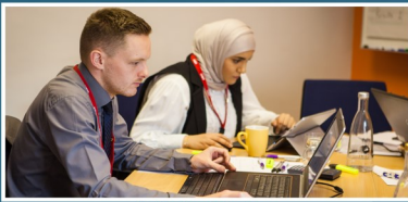
Making tough decisions