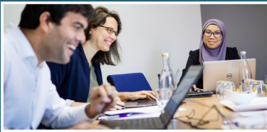
Working hard during the Final

Supported by the Institution of Civil Engineers since 1988