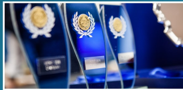
Could you be claiming one of these MERIT 2022 awards?