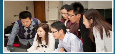
Making tough decisions