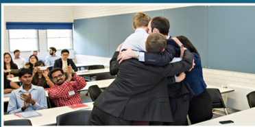
The joy, excitement and relief of winning MERIT