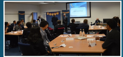
Preparing for the MERIT Final